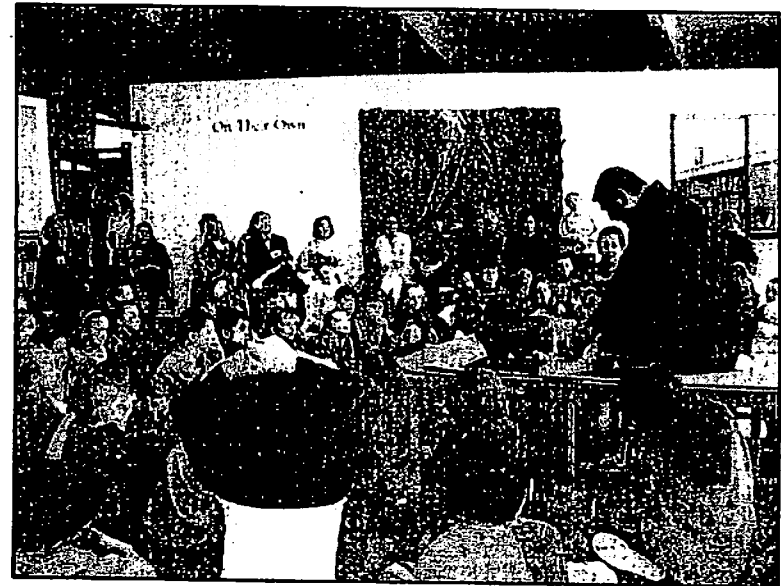
Second graders watch as the teamaster prepares the traditional Japanese tea ceremony.